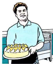
He has made a cake.