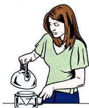
She's making coffee.

Make s'emploie dans le sens de fabriquer, créer, produire.